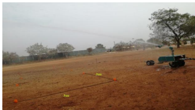
Fig. 1. Traveller Rain Gun (Sprinkler System).

Rotatable sprinkler heads with gearbox and adjustable for full or part circle coverage, featuring medium and high pressure operations, and high efficiency. This model is an introduction to the professional series. Changeable nozzles and dynamic water jet breaker system enable a perfect irrigation with evenly distributed water. Suitable for using in any type of delicate or rough agricultural applications; widely used especially on wheat, maize, and clover. Makes full and semi-circle turns at the same speed; ideal for agricultural areas, sport fields, and mines; suitable for portable and fixed systems. Range of usable nozzle diameter is 10 to 20mm, water consumption is – 6.5 to 44m 3 /h and shooting are –19 to 43m.