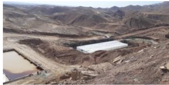
Fig. 3. New HDH based on seawater greenhouse, Naft e Sefid, Shushtar, Khuzestan, Iran, 2019.

covers were made of UV resistant Polyethylene sheets of 2 \mu m thickness with 7% anti-UV material, were in a 6mm envelope and formed a cube shape greenhouse. A fan (80 cm diameter; 800 W power and 11500 m 3 h -1 ventilation capacity) extracted humid air to the condenser. Ground dehumidification was carried out in a condenser made of PVC tubing of 20 cm diameter 2 m underground over a distance of 50 m, the air was allowed to flow in and freshwater was produced and stored in the reservoir.